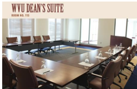
WVU DEAN'S SUITE ROOM NO. 115